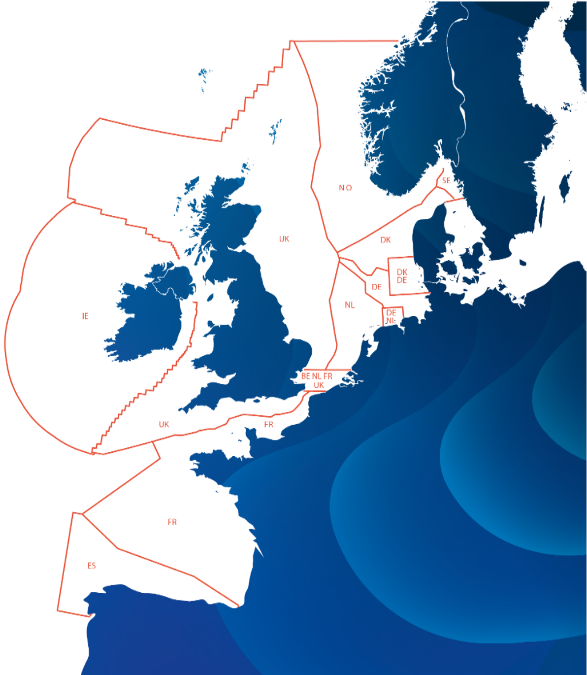
Figure 1 Bonn agreement zones of responsibility